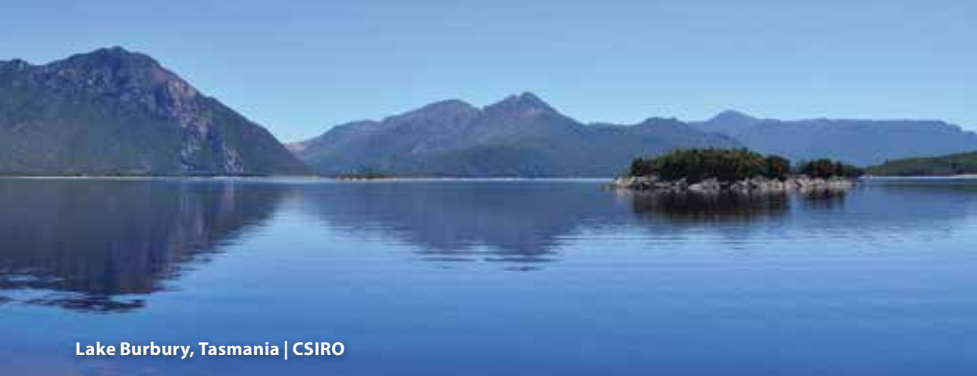
Lake Burbury, Tasmania