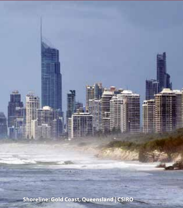
Shoreline: Gold Coast, Queensland