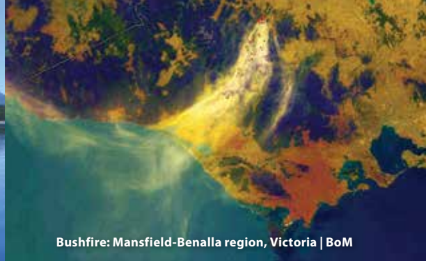
Bushfire: Mansfield-Benalla region, Victoria