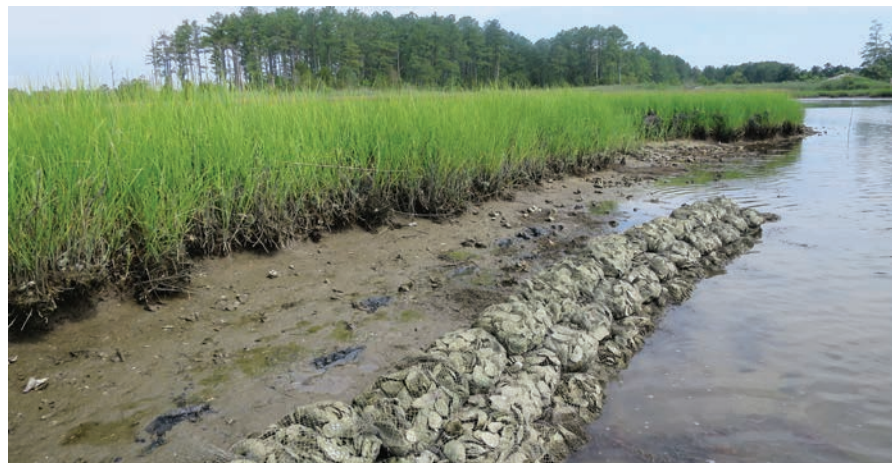
Oyster reef living shoreline using bagged shell in Virginia, US.

We are working towards achieving this through the implementation of on-ground case studies to inform coastal management and government policy.