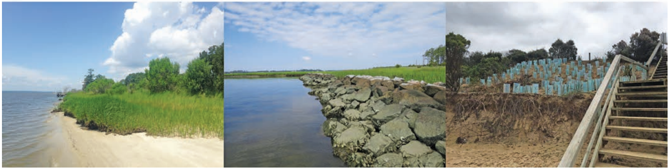
Examples of nature-based coastal defence. Soft ecological engineering techniques use natural elements only, such as the planting of saltmarsh (left image) or dune plants (right image). Hybrid ecological engineering techniques use a combination of hard and natural elements, such as rock sills in front of saltmarsh (middle image) or mangroves.