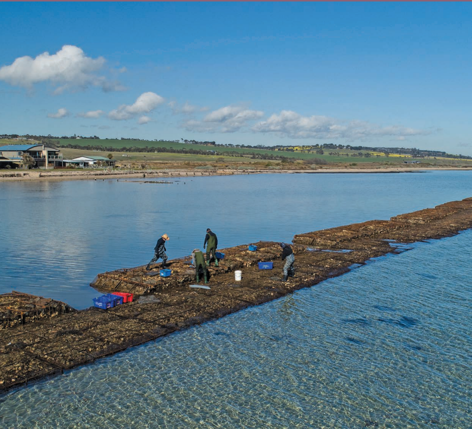
A shellfish reef breakwater for erosion control at Portarlington, Port Phillip Bay