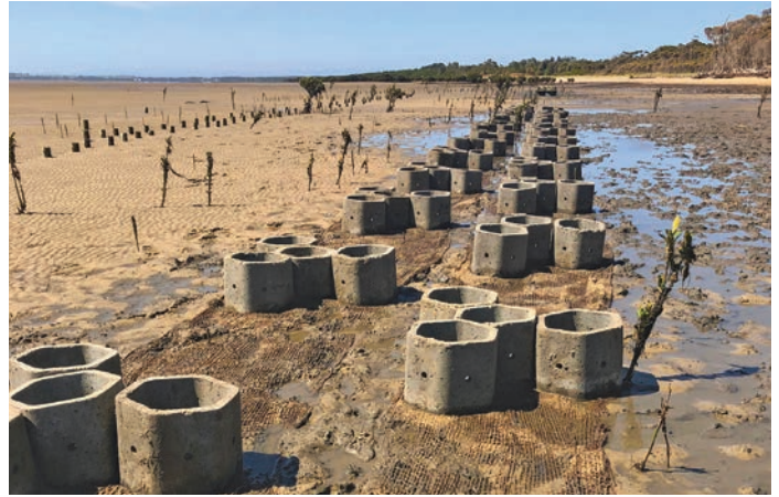
Mangrove pods for erosion control at Grantville, Victoria.

Custom-designed mangrove planters are being trialled in conjunction with mangrove plantings to provide erosion control in Altona, Grantville and Lang Lang in Port Phillip Bay and Western Port Bay. The mangrove planters are designed to improve the establishment of planted mangroves by reducing wave energy while the juvenile plants grow. We are monitoring these planters to measure the success of these structures in enhancing mangrove survival, reducing significant wave height and reducing shoreline erosion.